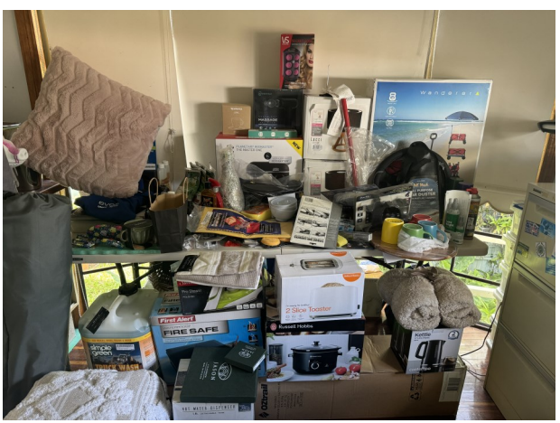
Part of the Monster Raffle Prize Pool