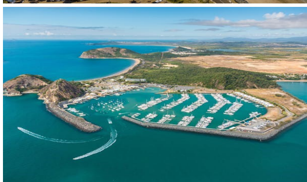
Views of the Capricorn Coast